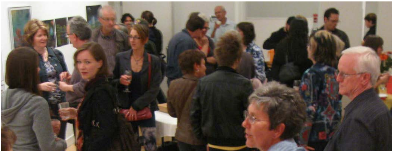
The opening of the 2010/11 Foundation Mentorship Program graduate showcase, Guided Journey , September 2011