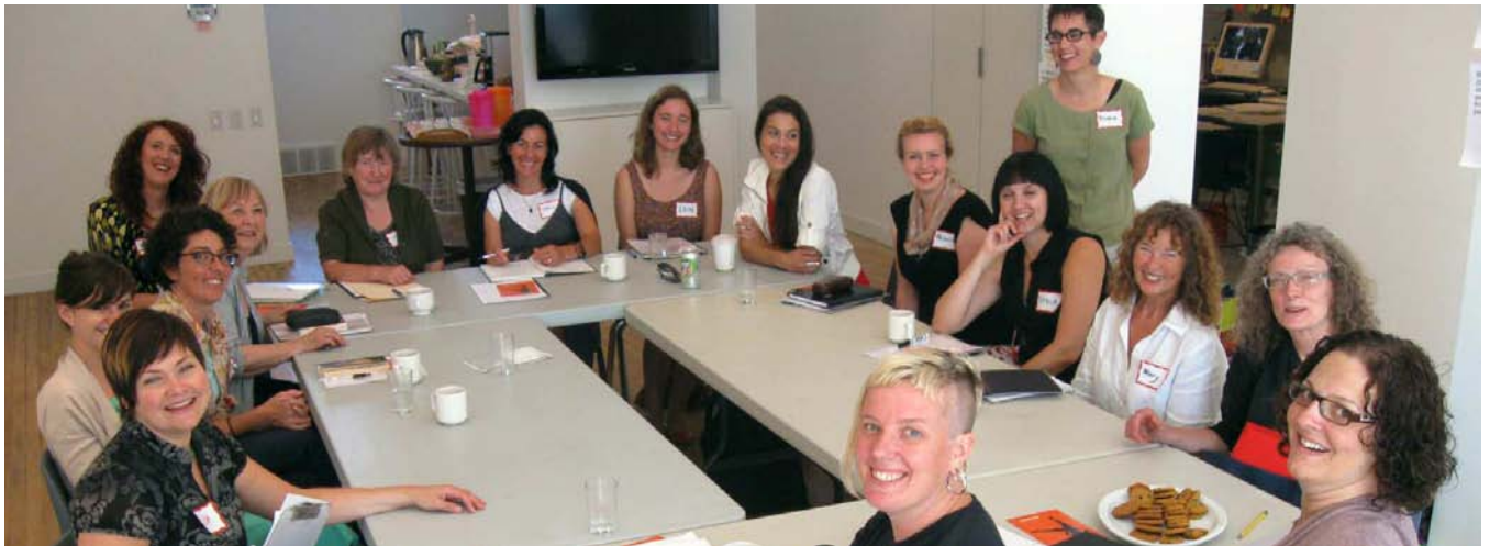
First meeting of the 2011/12 Foundation Mentorship Program, September 2011