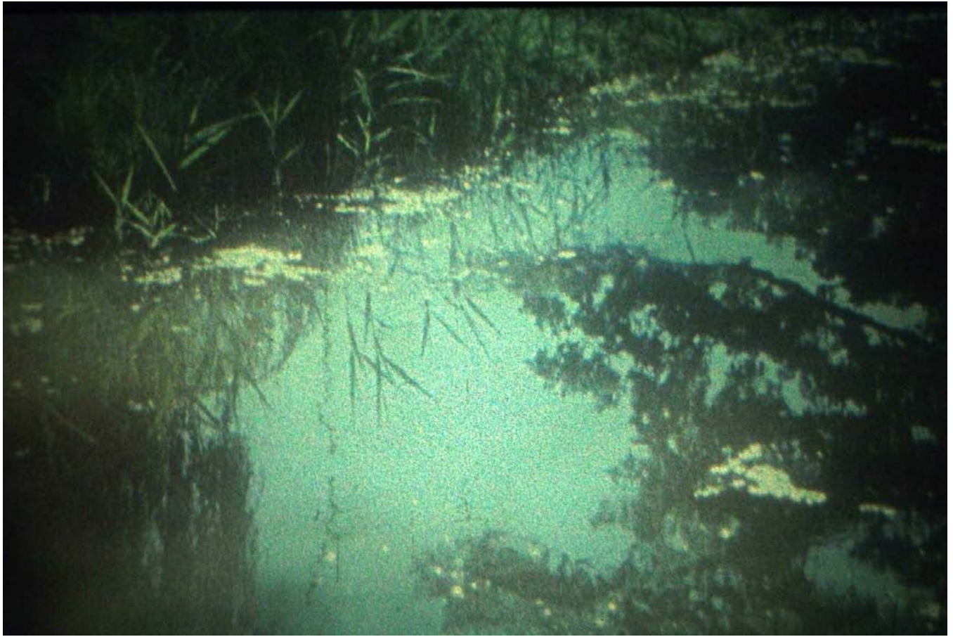
Irene Bindi, still from Celestinorosapalido , 16 mmm film, 2010

Friday, January 27, 2012, 7:30 pm at the Black Lodge