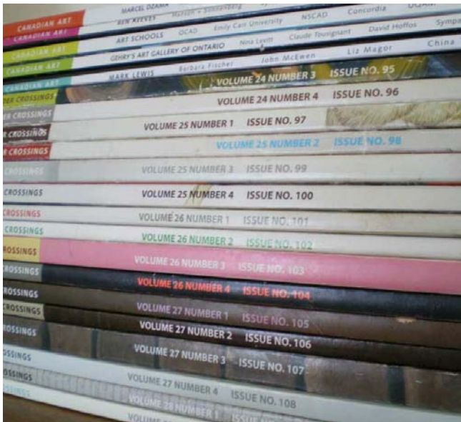
Border Crossings, 29 years in print and going strong!