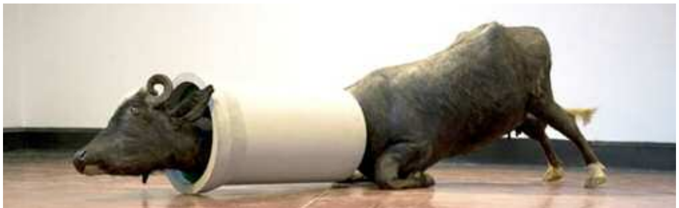
Huma Mulji, Her Suburban Dream , taxidermy buffalo, metal rods, duco paint, welded sheet metal, cotton wool, 142" x 37" x 36", 2009

Successful applicants will be charged $75 for the program. Specific meeting times will be decided by the group.