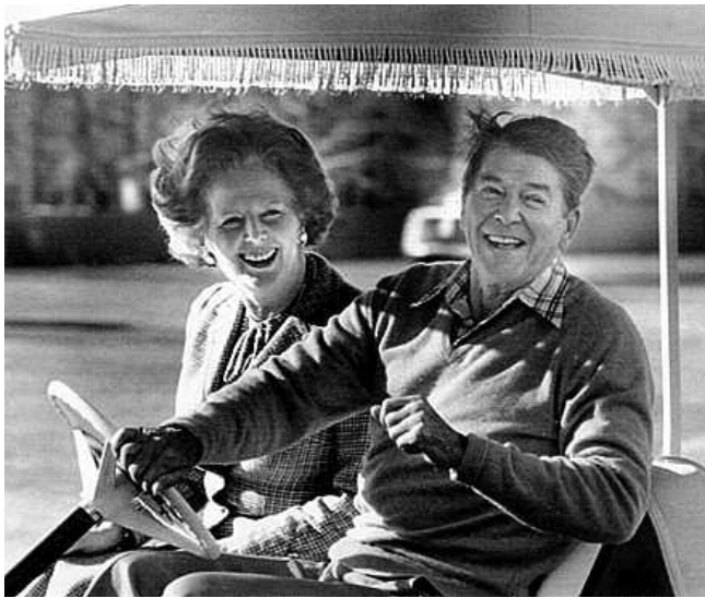
Thatcher and Reagan, best of chums.