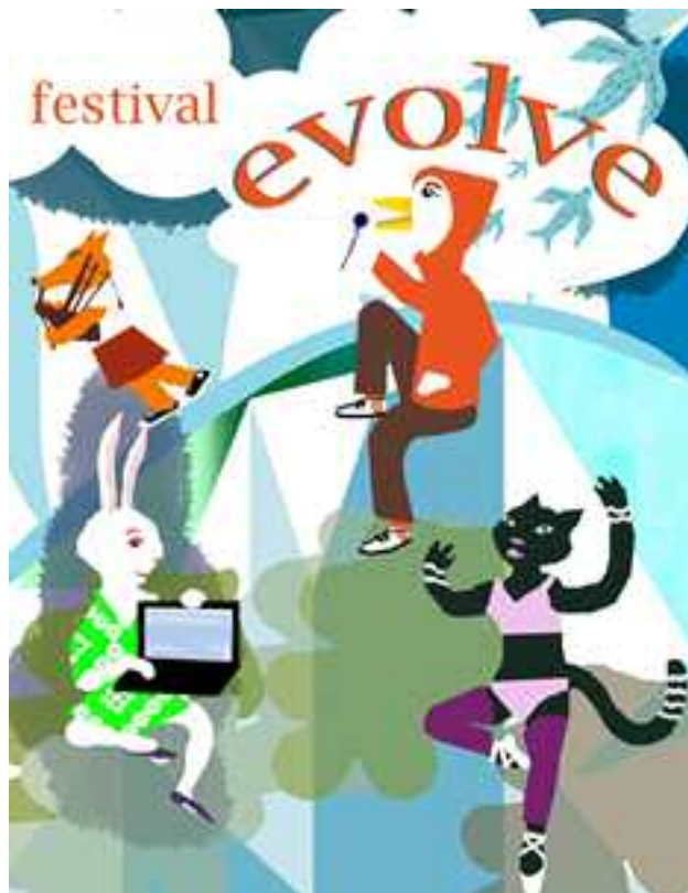
Karen Hibbard, sample music festival poster, 2011

Karen Hibbard is a free-lance illustrator/art educator and contemporary artist with experience working in the print, multi-media, film and animation industries. She has completed children's picture books with Planète Rebelle, created editorial illustrations for magazines and been hired as the illustrator for animation teams, film projects, and multimedia presentations.