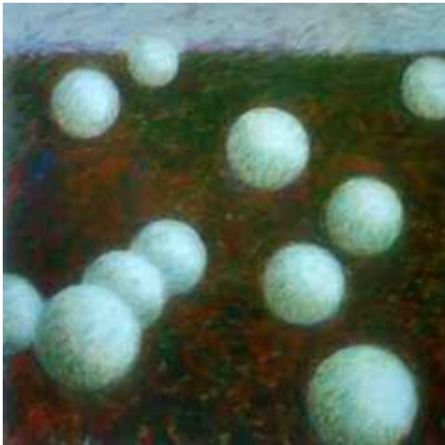
Caroline Dukes, Ball on a Field around Noon , acrylic on canvas, 66" x 66", 2003