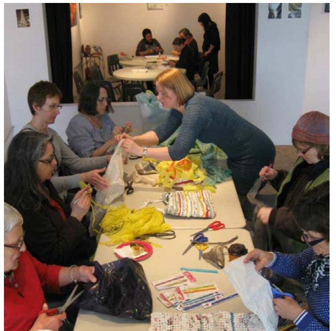
Last year's Crafravaganza was fantastically fun!