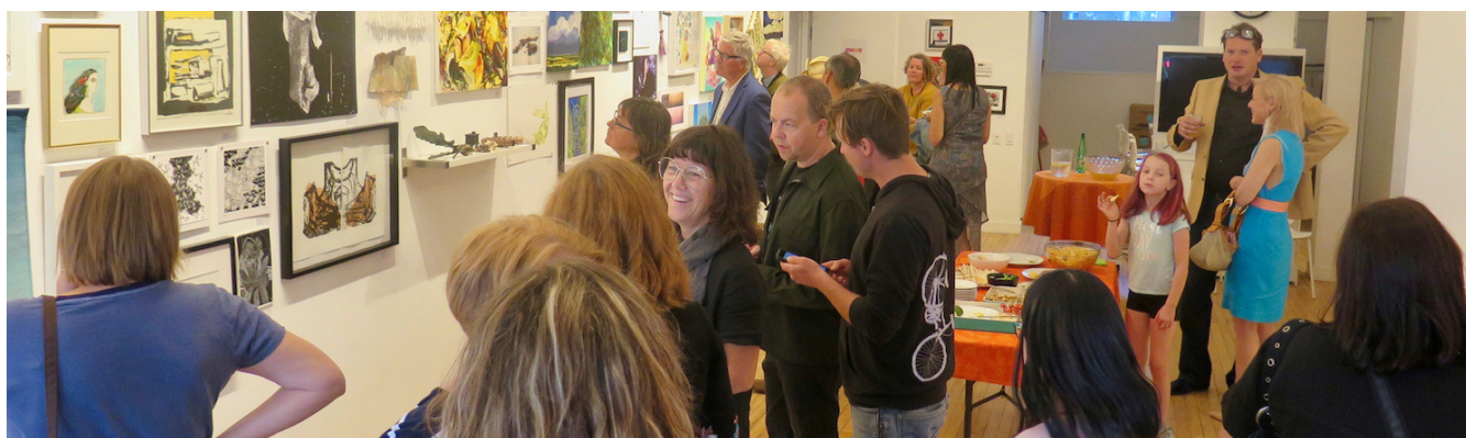
The opening of the MAWA members' show Roots and Tendrils , September 2019