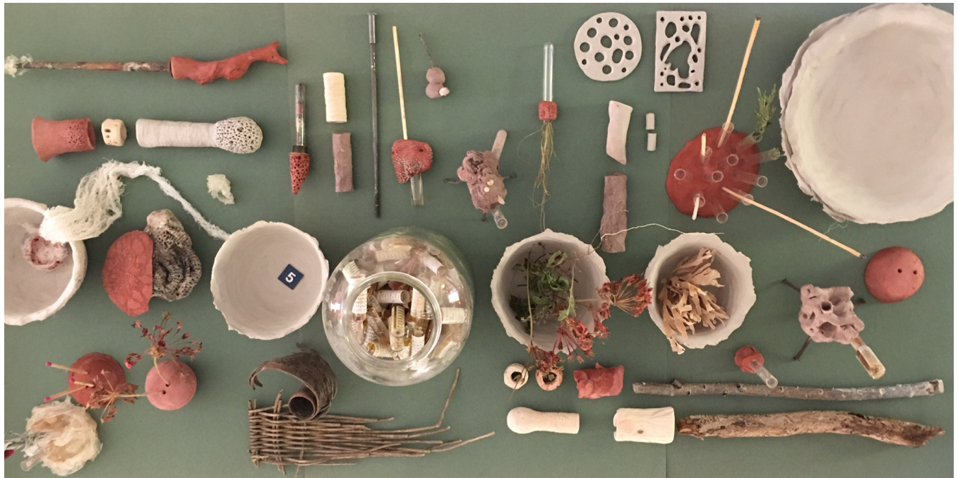
Allison Moore, Untitled; in progress , 2019