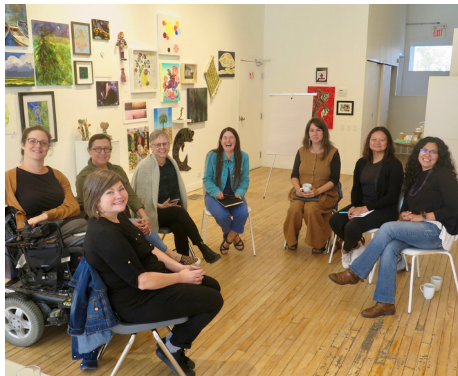
Mentorship Essentials workshop participants in the MAWA members' exhibition Roots and Tendrils , September 2019