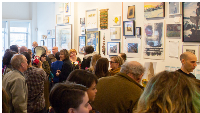
Art, cupcakes and more! Over the Top 2019.

Yes! Artists will receive a charitable tax receipt for the percentage of the sale that they choose to donate to MAWA.