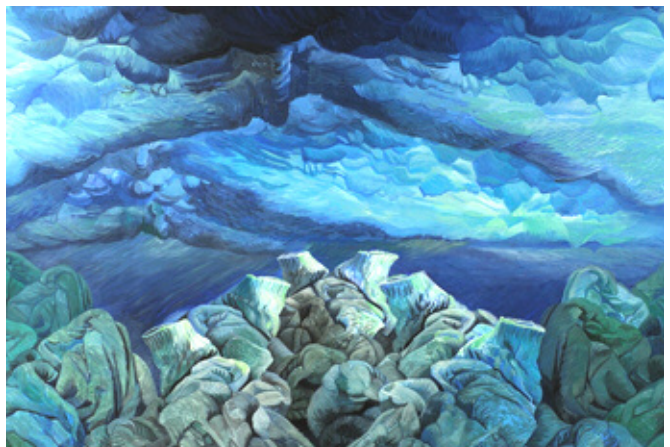
Bev Pike, Chill: Languorous swimming under Arctic ice provides hope for safe comfortable harbour , gouache on paper 2.4 m x 6.1 m

Reading: Lady Science, "Why We Need a Feminist Climate Science and How We Might Get It" https://www.ladyscience.com/features/why-we-need-a-feminist-climate-science-and-how-we-might-get-it