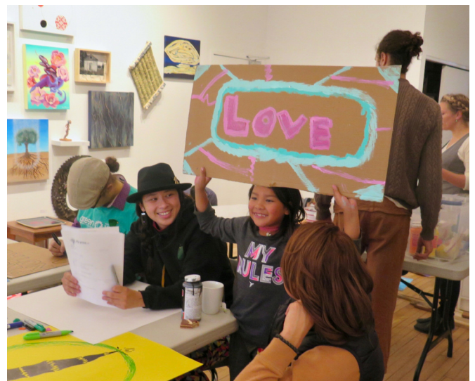
Climate Change Strike sign-making bee, September 2019