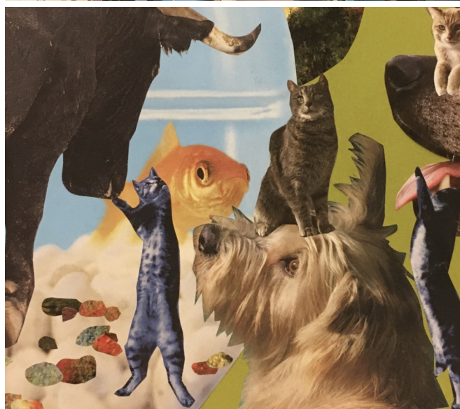
Last year's Collage and Conversation , with collage by Mary Ferguson, January 2019