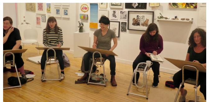
Figure Drawing, September 2019