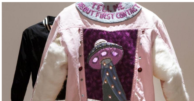
Whess Harman, Tell Me About First Contact , Potlatch Punk Series, 2018

As part of the Beadings Symposium: Winnipeg 2020 , MAWA is hosting this special lecture. Beadings Symposium: Winnipeg 2020 is a